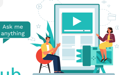
Virtual Journal club